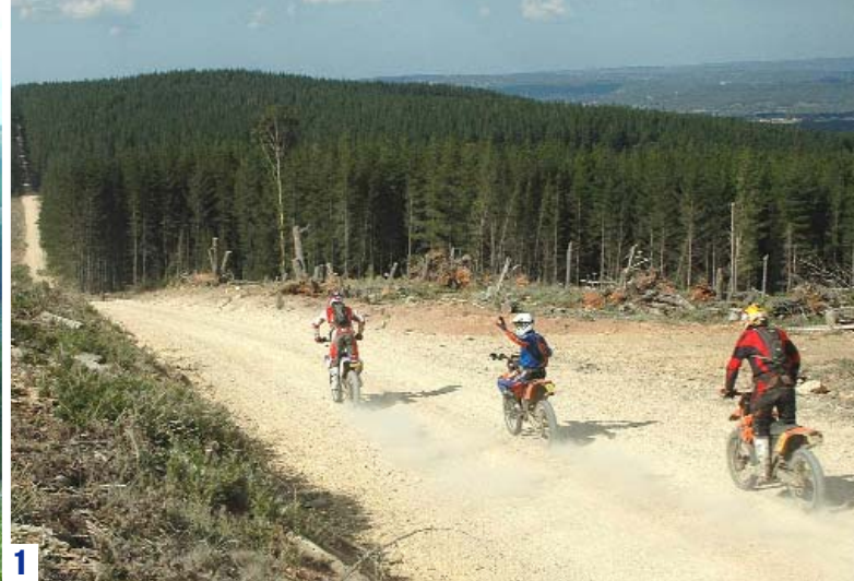
1 MAIN: See those trails and forests disappearing off into the distance? It's all part of the feast of wicked riding on offer with Sunny Corner Trail Tours. 1. This is about as open as the transport sections get, the rest of the time you are deep in the forests. 2. Trail boss Paul McLachlan fires his KTM thumper up a gnarly hill climb. 3. Poppun gives the General's slap-up feed at the lunch stop a big thumbs up.